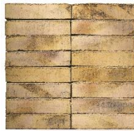
EW0470 Messing LESS

The illustrated products below are examples of products covered by this EPD.