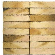
EW0491 Magma LESS