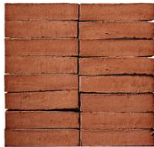
Basis brick EW2207