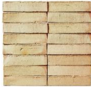
Basis brick EW2123