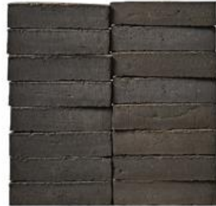
Blue braised product EW2702