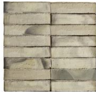
Blue braised product EW2704