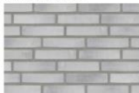
B713 Silver Falcon