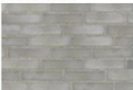
B711 Silver Pacific