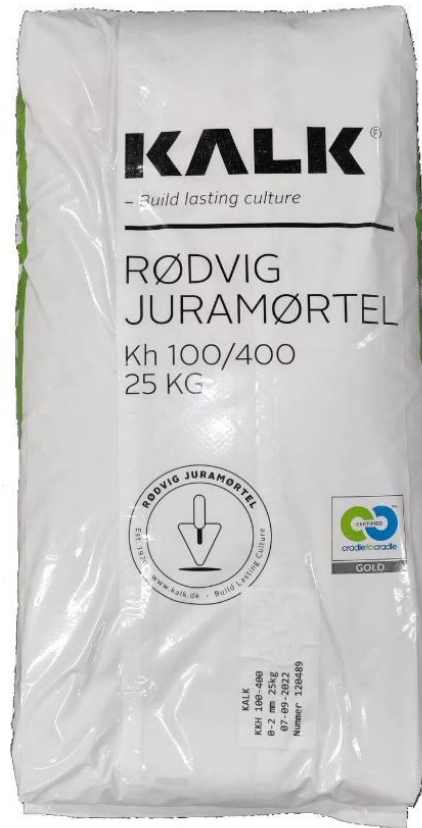
Figure 1 – Picture of the declared product, with packaging.