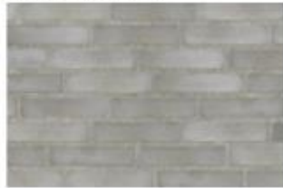
B711 Silver Pacific