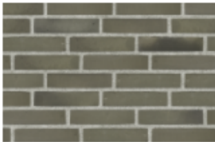
B704 Silver Shadow