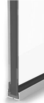
Figure 2 FG 42.76 mm