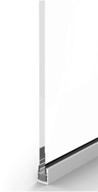
Figure 1 FG 12.76 mm, 17.52 mm, and 21.52 mm