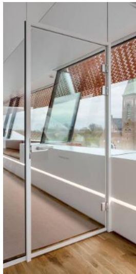
Figure 1: Example of a FD glazed door.