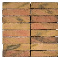
EW0494 Efterår m/ku

The illustrated product below is an example of a product covered by this EPD.