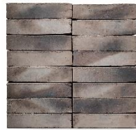
EW0451 Stål LESS