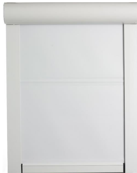
Picture of Blackout System with a rounded headbox