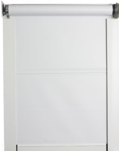
Picture of Blackout System Build-In model