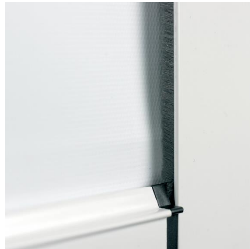
Picture of side rails with mohair sealing