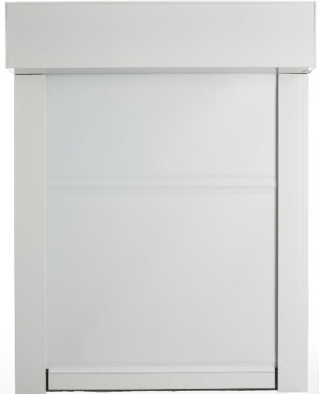
Picture of Blackout System with a straight headbox

rolled up on. Furthermore, the Blackout System can be available with a motor or a crank control system. This specification is found in the product name. The photos below show the build-in Blackout System and the general Blackout System with a headbox.