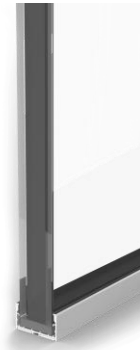
Figure 2 FG 42.76 mm