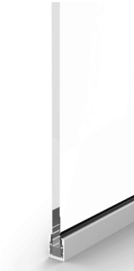
Figure 1 FG 12.76 mm, 17.52mm, and 21.52mm