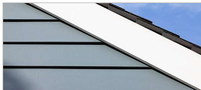
FIGURE 3: HARDIELINEA® IN USE

Fibre cement boards produced by James Hardie are classified CPC 37570 under the UN CPC classification system v2.1.