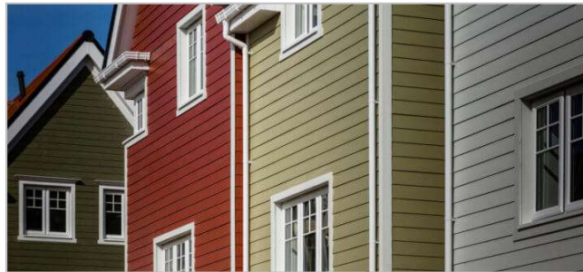
FIGURE 1: HARDIEPLANK® IN USE

This EPD applies to three painted fibre-cement panel products used for external cladding of buildings: HardiePanel®, HardiePlank® and HardieLinea® (pictures below). The products are supplied as panels (boards) of standard dimensions. These products have been engineered for maximum longevity in the European climate, and withstand a diverse range of weather conditions such as wind, rain, hail, snow and sun. They are also resistant to mould, decay, pests and rot.