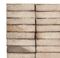
EW2173 Cassis Coal