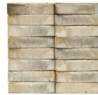
EW2169 Cold Hawaii