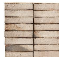
EW2173 Cassis Coal