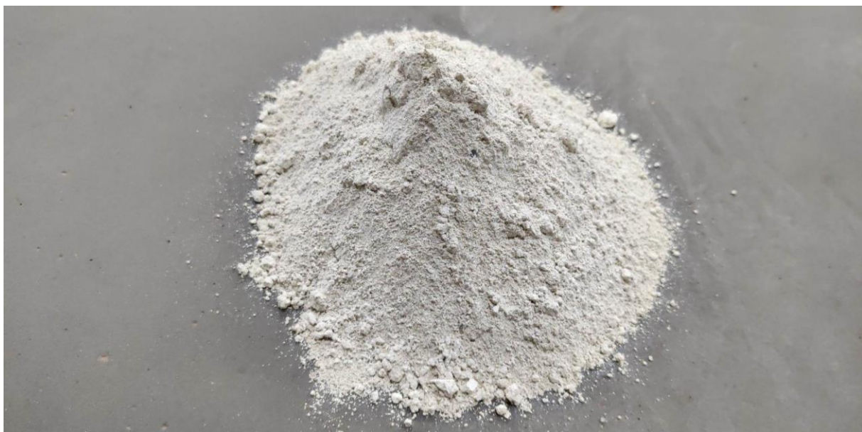
Figure 2 – Picture of the declared product, without packaging.