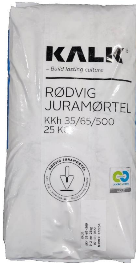
Figure 1 – Picture of the declared product, with packaging.