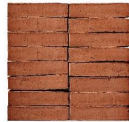
EW2207 Rød Mørk