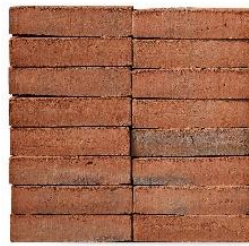
EW2260 Red coal

The illustrated products below are examples of products covered by this EPD.