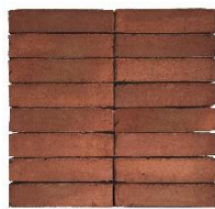
EW0465 Rød nuanceret LESS

The illustrated products below are examples of products covered by this EPD.