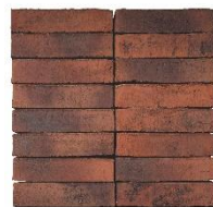
EW0466 Kobber LESS