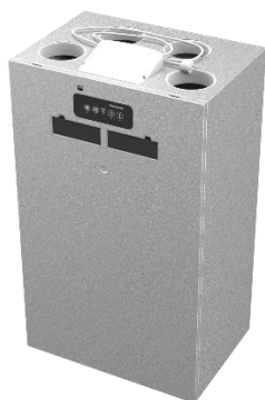
Figure 1 HCV 300 PRO