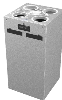
Figure 2 HCV 400 PRO and HCV 460 PRO